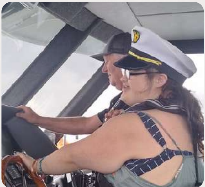
Wish 4 Fish